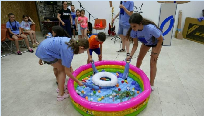
Click the photo above to watch the children enjoying one of our ocean-themed camp games!

On the first night, I asked the children if they knew what a prophet was and if they thought it would be a good job to have. We talked about the task God gave Jonah and how Jonah fled because he did not want to do it. The next morning, we discussed how the sailors who agreed to take Jonah to Tarshish got caught in a terrible storm and thought they were going to die. In our small groups, we acted out the storm and how nothing the sailors did worked to calm it until they finally called out to Jonah's God and threw Jonah overboard.