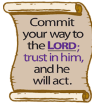
Psalm 37:5, NRSV