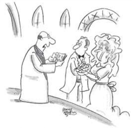
"Remember, you're under oath."